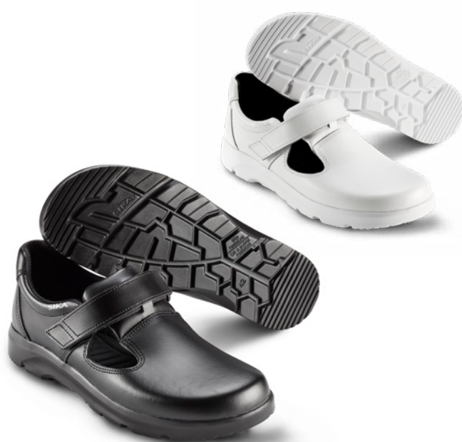
173110 / OPTIMAX

SPECIAL FEATURES: Sandal with adjustable Velcro® closure. Band can be cut without fraying