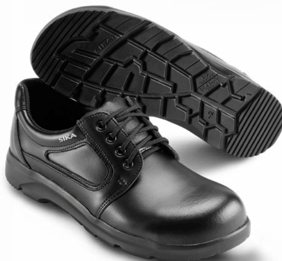
172201 / OPTIMAX