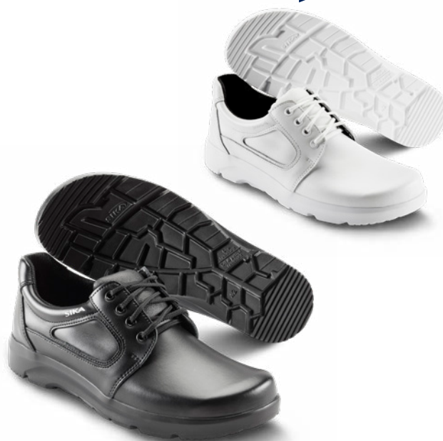
172001 / OPTIMAX