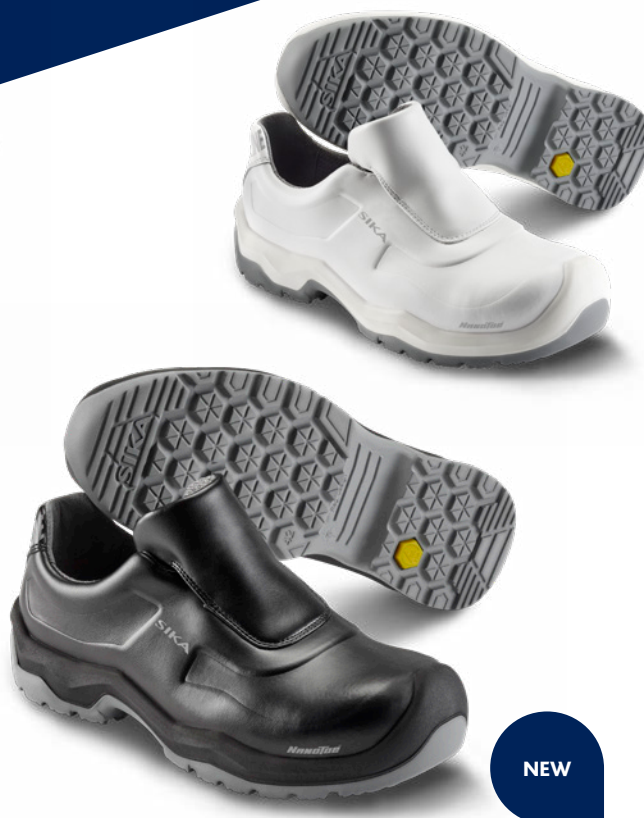
202410 / FIRST

SPECIAL FEATURES: Elastic over instep. Metal free.