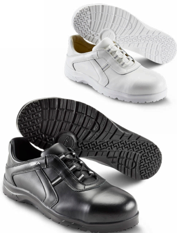
19223 / FUSION