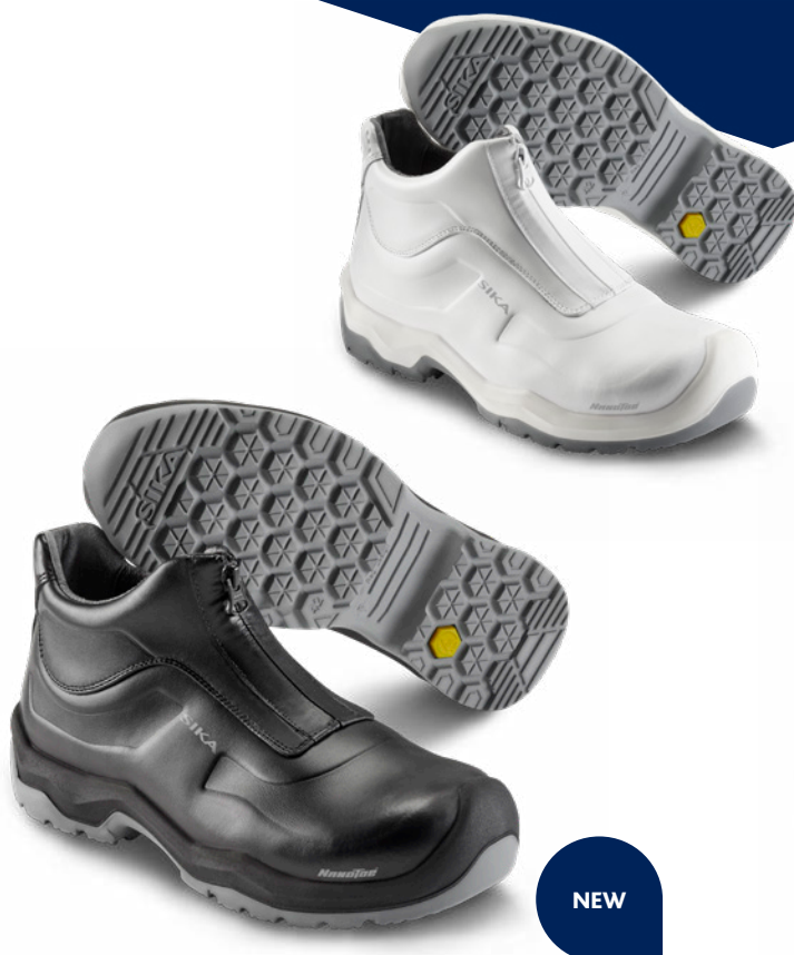
202510 / FRONT

SPECIAL FEATURES: With zip and elastic over instep. Metal free.