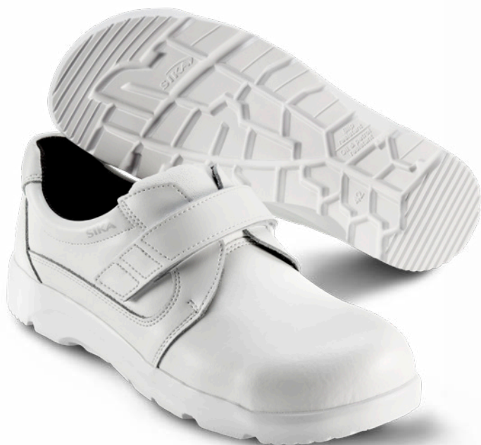
172302 / OPTIMAX

SPECIAL FEATURES: Shoe with adjustable Velcro® closure. Band can be cut without fraying