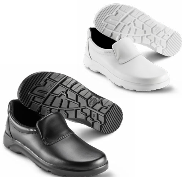
172100 / OPTIMAX