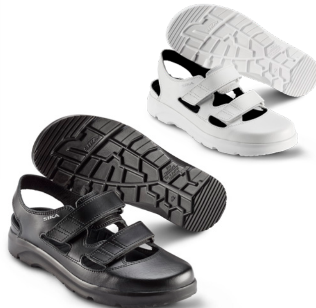
173105 / OPTIMAX

SPECIAL FEATURES: Certification: OB+A+E+FO+SRA. Sandal with adjustable Velcro® closure. Band can be cut without fraying