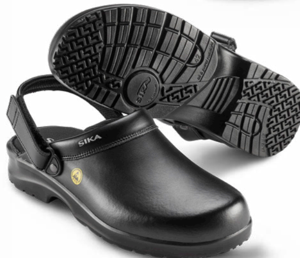
19466 / FUSION CLOG ESD