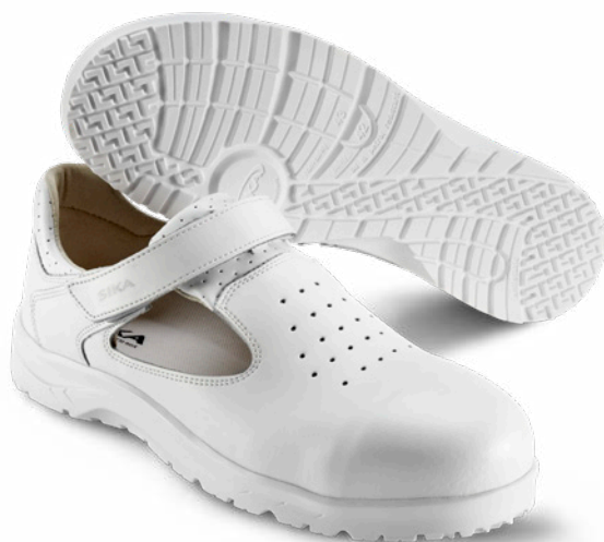
19225 / FUSION

SPECIAL FEATURES: Adjustable Velcro® closure and perforations for extra breathability